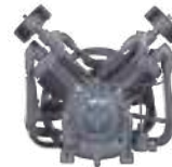
BARE COMPRESSOR PUMP